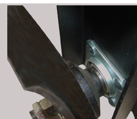
Triple sealed bearings